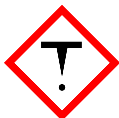
Class D - Poisonous and Infectious Material Division 2 Material Causing Other Toxic Effects