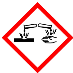
Class E – Corrosive Material